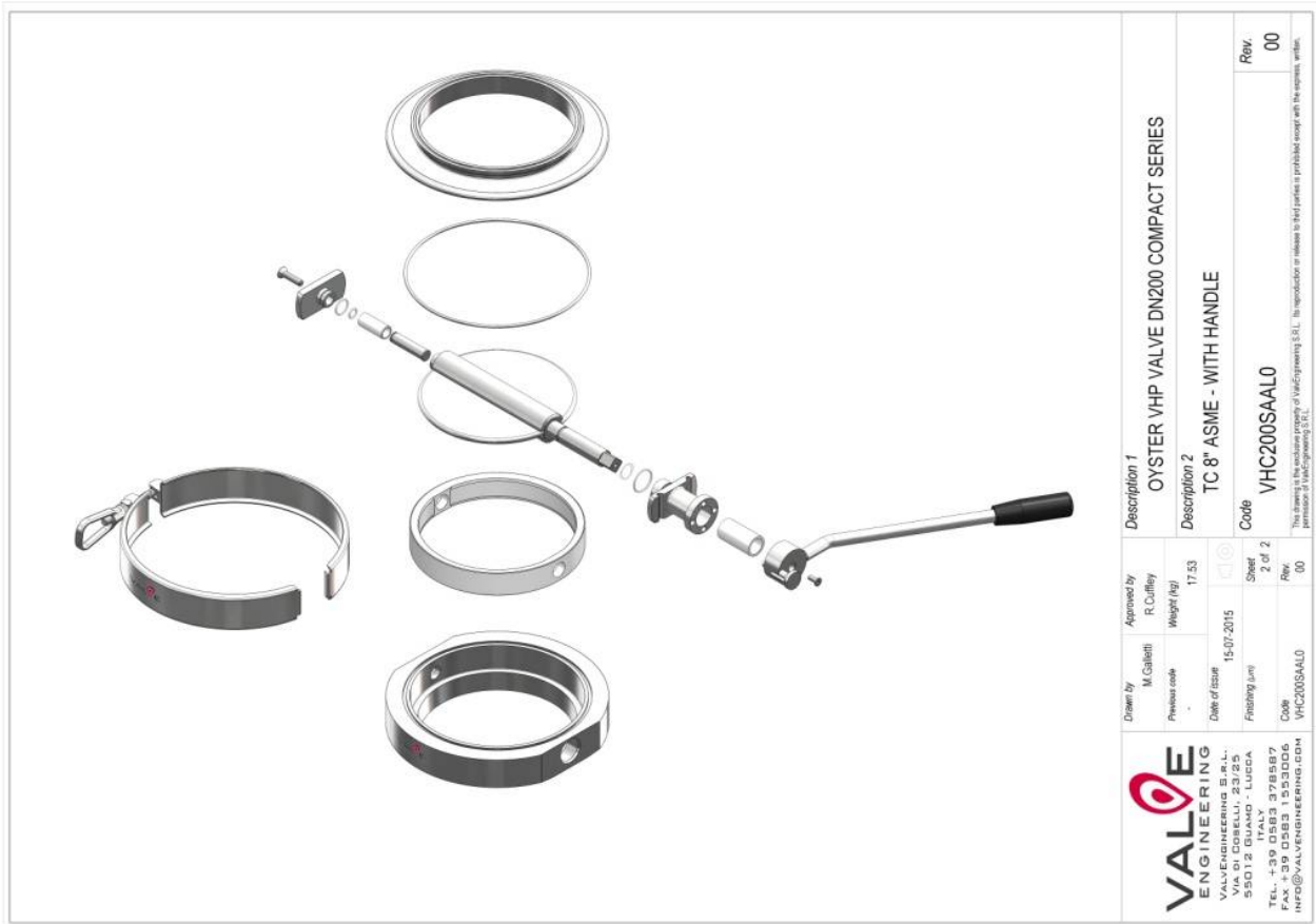
Table of materials: